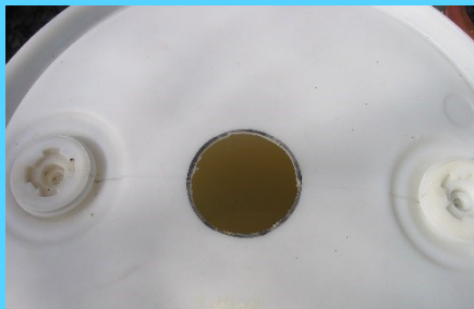
Top hole for water entry from down spout.