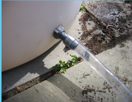
Lower hose barb and attached vinyl hose.