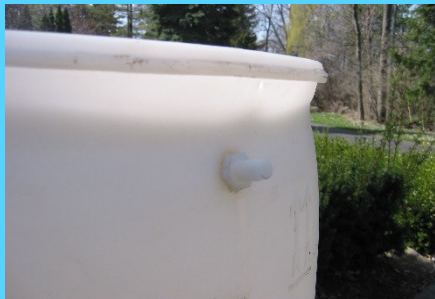
Upper hose barb for water overflow.